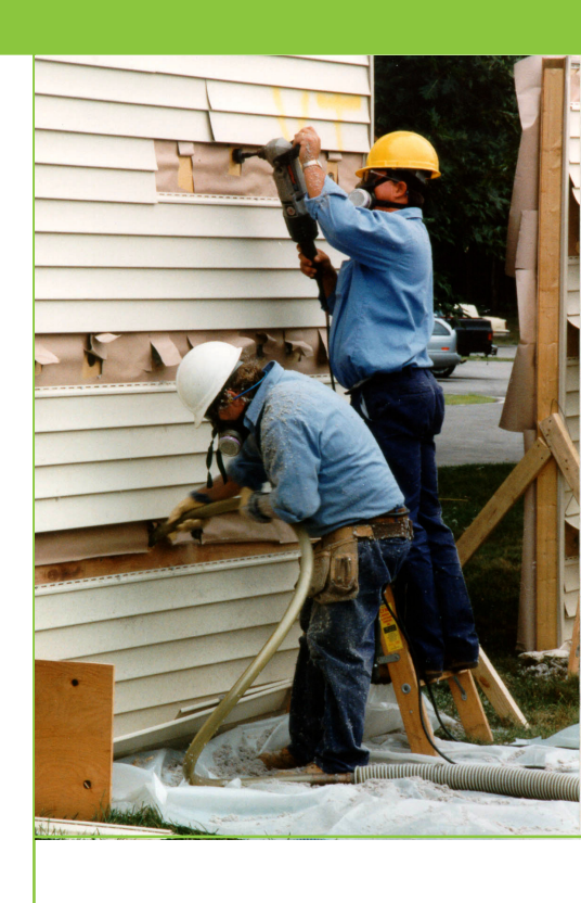
Weatherization staff install sidewall insulation to increase the energy efficiency of a home.