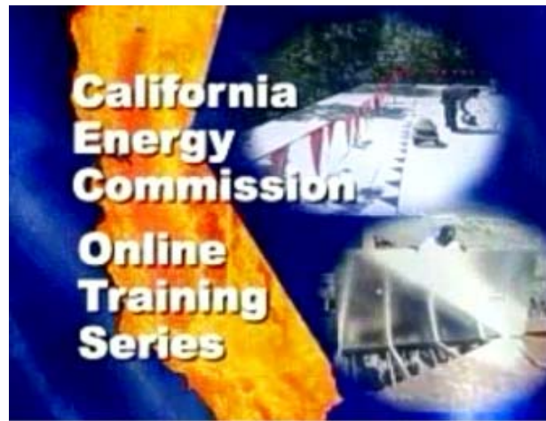
Figure 1-4 – Energy Commission Video Series

The Energy Commission has a series of streaming videos that explain energy efficiency concepts and the application of the standards. These videos cover topics including plan checking, HVAC, HERS, water heating, building envelope, and renewable energy. They can be viewed at http://www.energyvideos.com .